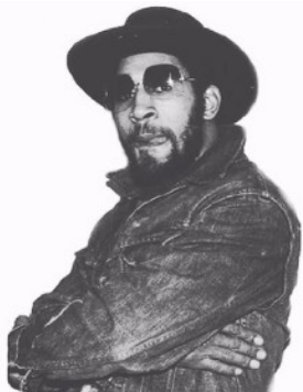
This Jamaican American is the first Hip Hop DJ. What is his name?