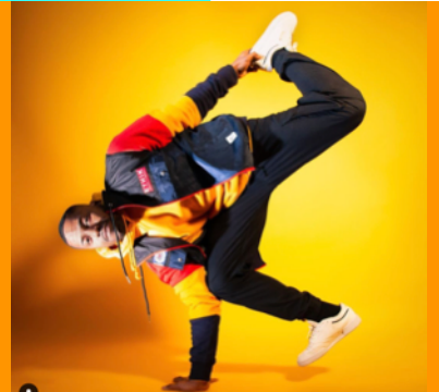
B-Boy BoxWon, Philadelphia